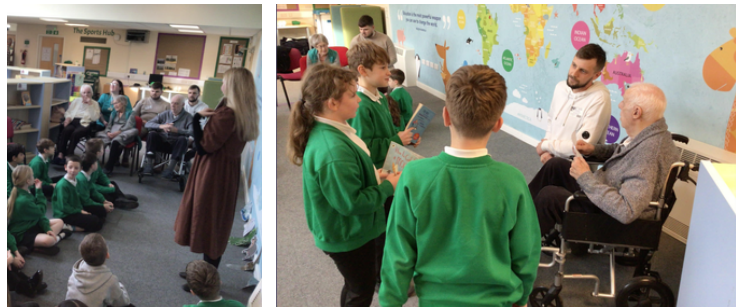
Year 5 shared stories with care home residents

Last week Year 5 welcomed residents from Cleves Place Care Home. They had written letters to the residents just before Christmas so I know a lot of the children were excited to meet them. They celebrated 'read aloud day', sharing stories and our favourite books with each other. We look forward to continuing to build more links with our local community in the near future.